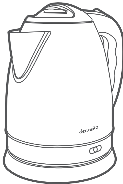
KUKT002B STAINLESS KETTLE